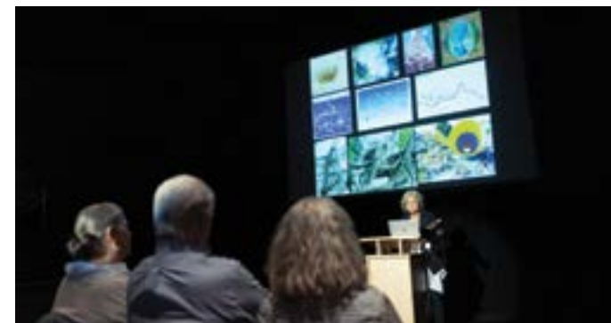
TOP Following a chilly outside dedication, guests were treated to a reception in the Cloud Room at the Des Moines International Airport where they enjoyed snacks and drinks, lively music by the B2wins and a video (CENTER) of the project showing the installation process from start to finish created by Leonardo Sierra.