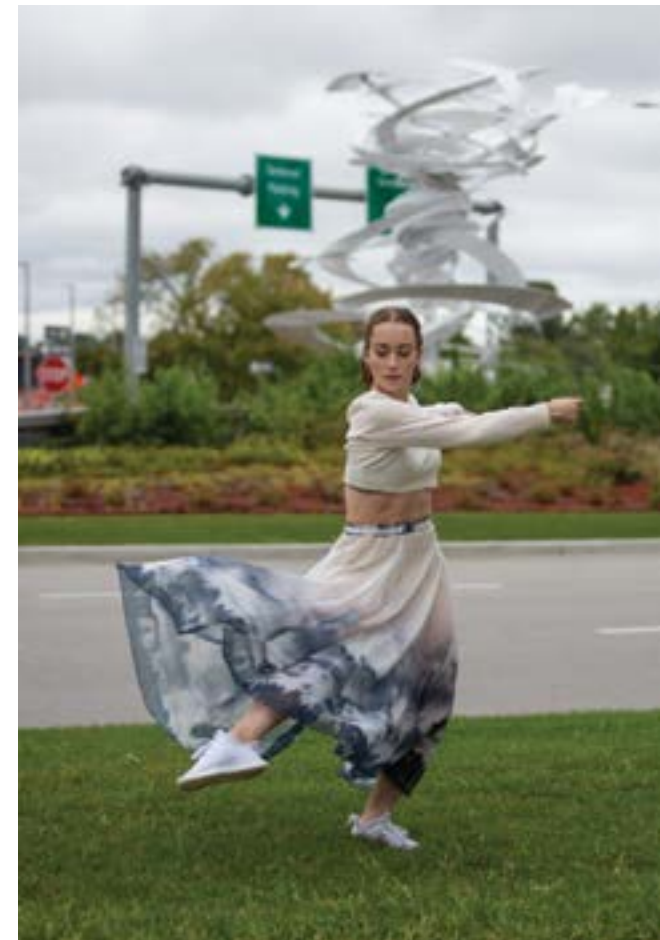
Ballet Des Moines dancers captured the spirit of the sculpture in their performance during the dedication.

A weekend of celebrations marks the completion of this monumental public artwork by Alice Aycock