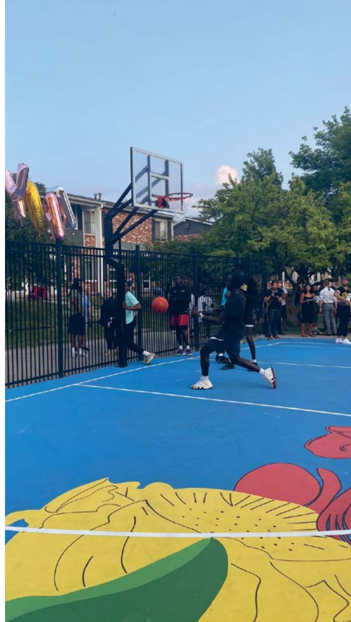
The first basketball game in more than a year was played on the newly renovated court, Swish, during the dedication in August, 2021.