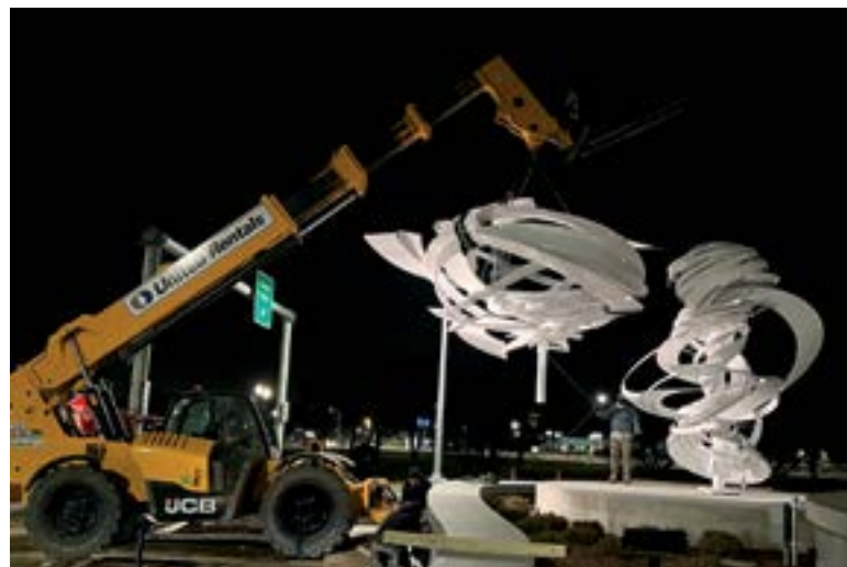
A team of expert installers from Wolfe Magritte worked diligently day and night for five days to reconstruct the 267 pieces of metal into the Aycock's soaring Liftoff .